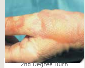
2nd Degree Burn