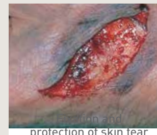
Fixation and protection of skin tear