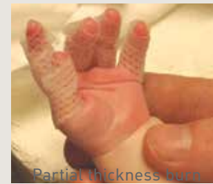
Partial thickness burn