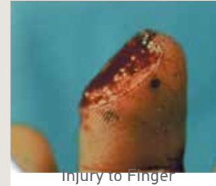
Injury to Finger