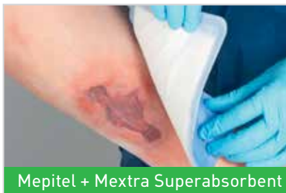
Mepitel + Mextra Superabsorbent