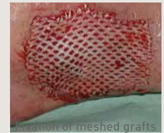
Fixation of meshed grafts