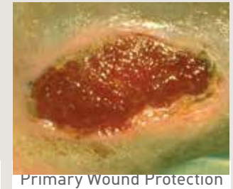
Primary Wound Protection