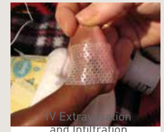
IV Extravasation and infiltration