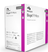
Biogel® PI Micro

NEW Biogel gloves manufactured without accelerators†