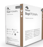
Biogel® PI OrthoPro®