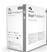
Biogel® PI UltraTouch S