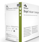
Biogel® Indicator® Underglove