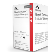
Biogel® Skinsense® Indicator® Underglove