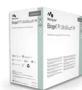
Biogel® PI UltraTouch® M