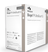
Biogel® PI UltraTouch® G