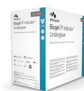
Biogel® PI Indicator® Underglove