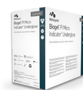
Biogel® PI Micro Indicator® Underglove