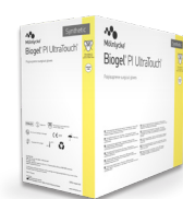
Biogel® PI UltraTouch®