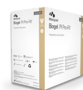
Biogel® PI Pro-Fit®