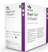
Biogel® Optifit® Orthopaedic