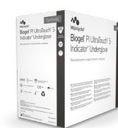
Biogel® PI UltraTouch S Underglove