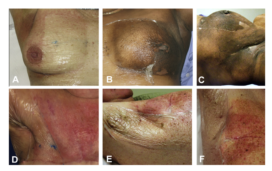
Fig. 3. Photographs of irradiated skin of four trial patients. (A) 1 week after completion of treatment; (B and C) same patient at the last fraction; (D) 1 week after completion of treatment; (E and F) same (male) patient in final week of treatment.